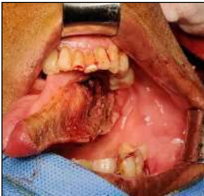
Fig 3: Hemiglossectomy