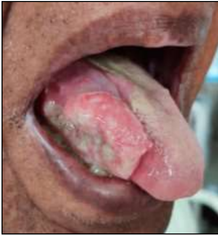
Fig 1: Right Lateral Border CA Tongue